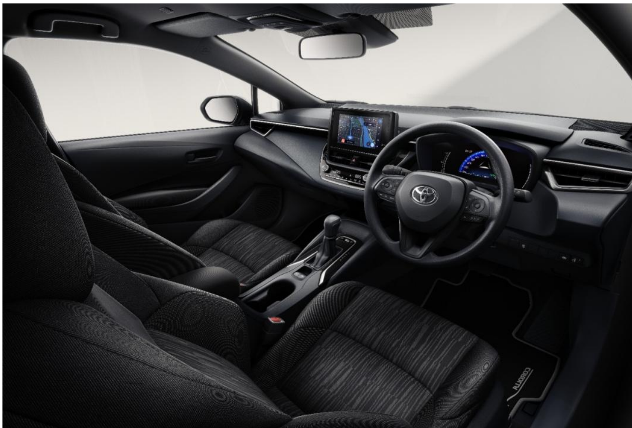
Black Fabric with Grey Stitching