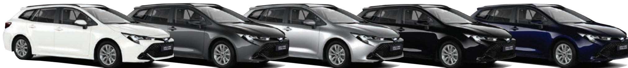
Pure White (040)