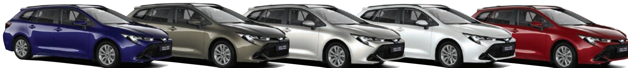
Juniper Blue (8Y8)