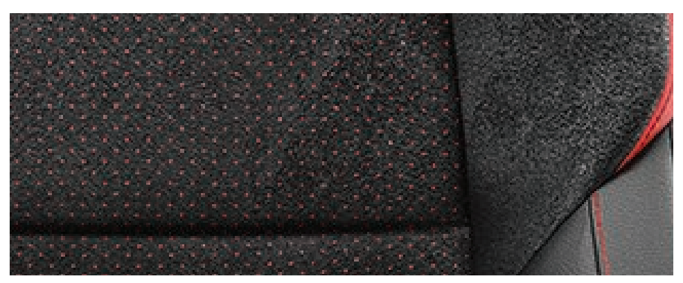
Black leather and synthetic suede (LG23) GR SPORT