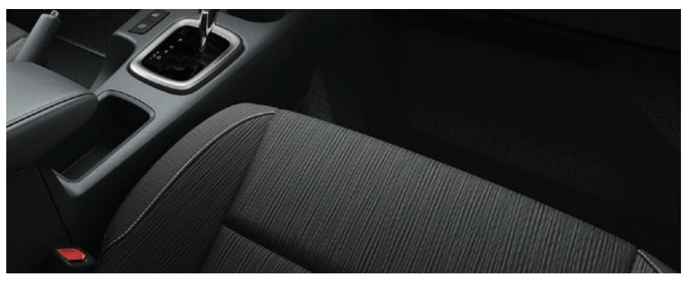
Black fabric with vertical pattern (FE20) SR5 Grade

Black fabric with oval pattern (FC20) DLX Grade