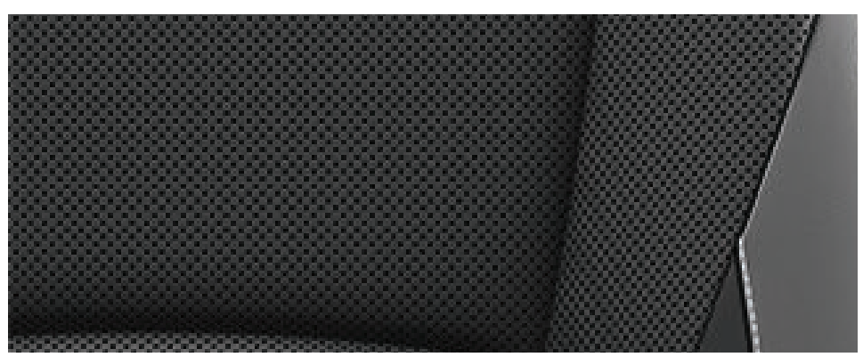
Dual tone perforated leather (LE21) Invincible Grade