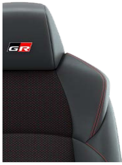
GR SPORT (EC20)