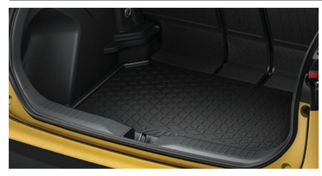
BOOT LINER Tailored to fit the boot of your vehicle and provide protection against dirt and spills.