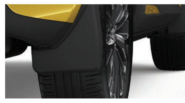
FRONT & REAR MUD GUARDS Designed to minimise water, mud and stones spraying onto your car's body.