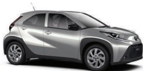
Atomic Silver (1L0)