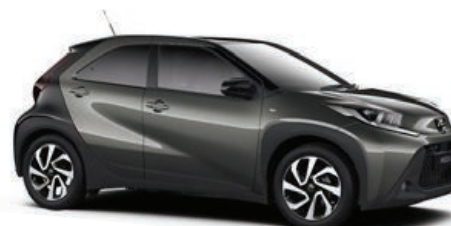
Cardamom Green Bi-Tone (2VK)