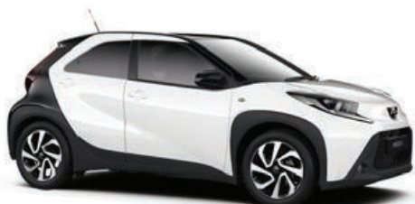
Pure White Bi-tone (2NR)