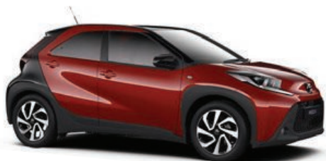
Chili Red Bi-Tone (2VH) (Pearlescent)