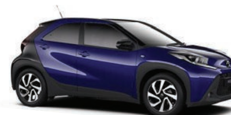
Juniper Blue Bi-Tone (2VL)