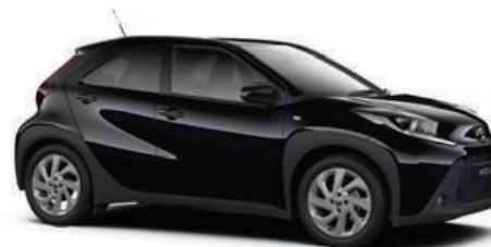
Night Sky Black (209)