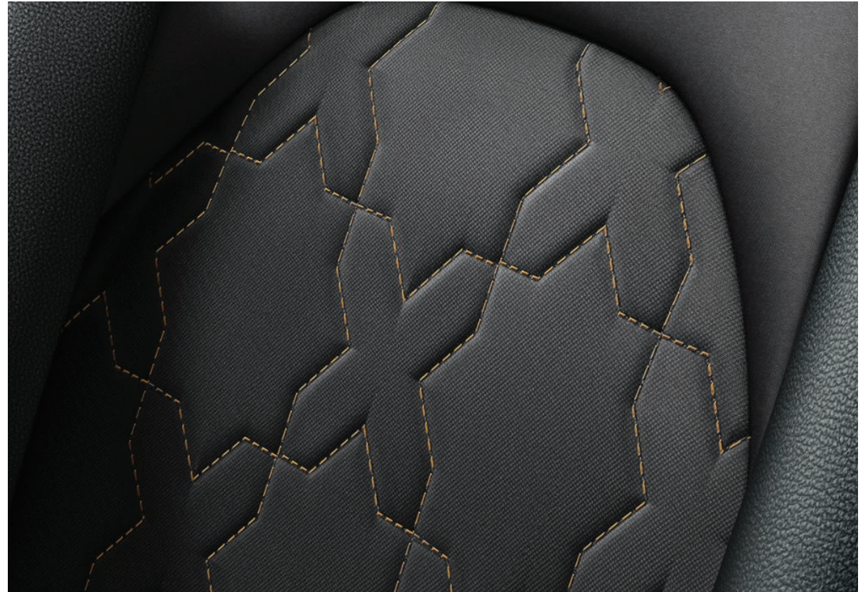
**Black fabric with leather-like bolsters with dark headliner - AYGO ENVY ONLY

*Side bolster colour matches exterior colour choice except for Pure White