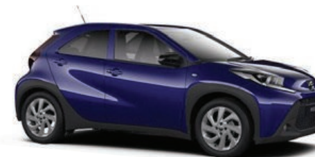
Juniper Blue (8Y8)