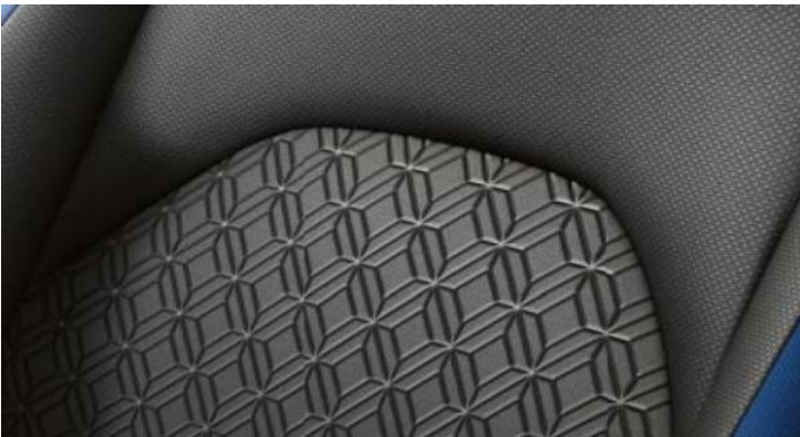
*Black fabric with dark headliner - AYGO X DESIGN ONLY

*Side bolster colour matches exterior colour choice except for Pure White