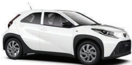
Pure White (040)