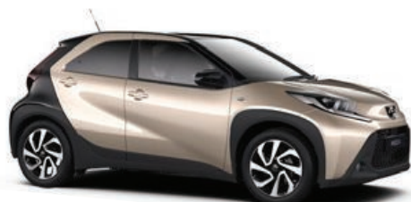
Ginger Beige Bi-Tone (2VJ)