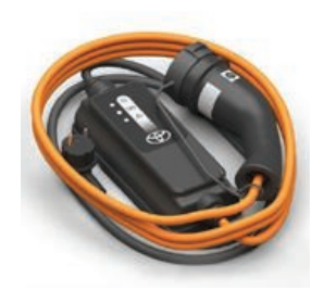
SLOW IF NECESSARY

*DC Charging time subject to local conditions.