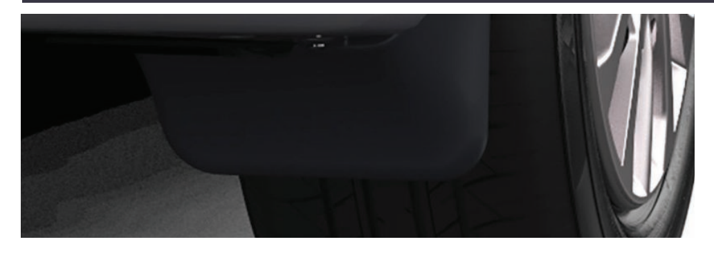
MUD GUARDS Designed to minimise water, mud and stones spraying onto your van's body.