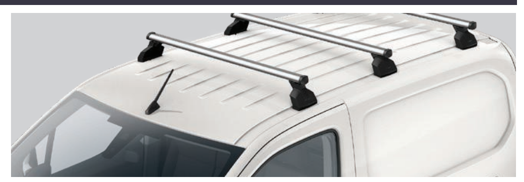
ROOF RACK (2 BARS)

Lockable aerodynamic aluminium design that is easy to install and remove. It combines with a wide range of specialised carrying attachments.