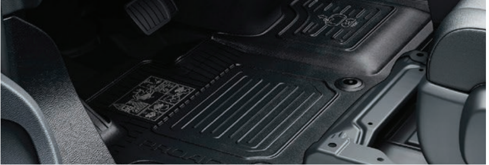
RUBBER FLOOR MATS The ultimate floor protection against mud, water, dirt and grime.